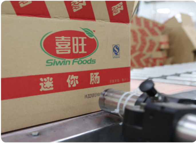
The advanced CleanFlow™ printhead