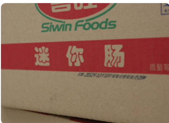
Specialty coated gift box printed online with production date and time and quality control information

Since Xiwang started using V411, the adhesion issues on the gift boxes have disappeared. Xiwang's codes are now crisp and legible and meet their high standards. V411, one of the hundreds of inks that have been designed in Videojet's labs for specific applications, is a solvent based ink that has a fast dry time on non-porous substances such as Xiwang's coated gift box. As one of the best plastics inks, V411 adheres well to the gift box's PE coating. It is also designed for superior rub resistance. Now Xiwang is able to get clear codes on its gift boxes that stay on the box and reflect their brand image. They no longer have to worry about customer complaints, product returns, and diminished sales. Also, the codes on their boxes provide an example of proper coding for similar companies in the region.