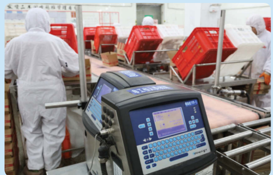
2 Videojet 1000 Line printers integrated into Xiwang's production line