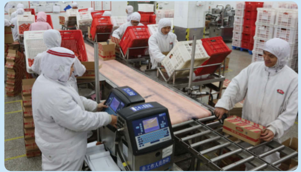
With standard message storage, the operator quickly changes codes during changeover

Since purchasing its first Videojet printer, Xiwang has purchased an additional 6 Videojet printers and is in the process of purchasing 2 to 3 more printers. Xiwang is expecting to continue its remarkable growth as it strives to create a well-known Chinese brand and eventually become a famous world-class food enterprise group. They are currently completing a plant expansion and are expecting to need more new printers as production increases in the future.